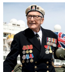
Every Poppy Counts!

Note from the Editor. You may have noticed that there is no war memorial relating to the Second World War in Bitteswell as all those that served thankfully came back, some with serious injuries, but no deaths recorded.